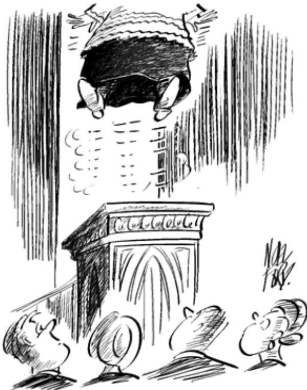
The fan-heater under the cassock idea proved not to be such a good one

Please have your £4 ready when your next issue is delivered.