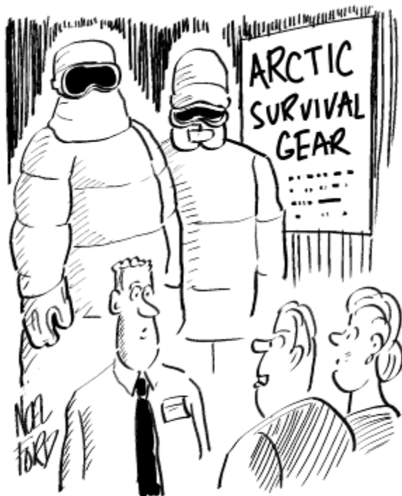
"We're looking for something to help us survive our church's early morning Winter services"